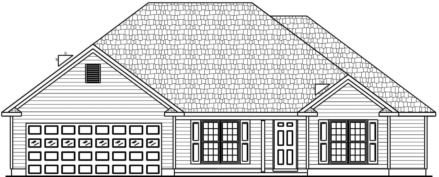
FRONT ELEVATION SC: 1/4" = 1'0"