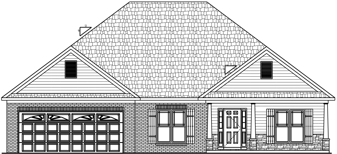
FRONT ELEVATION SC: 1/4" = 1'0"