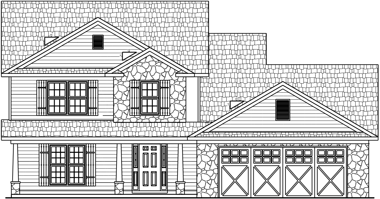
FRONT ELEVATION SC: 1/4" = 1'0"