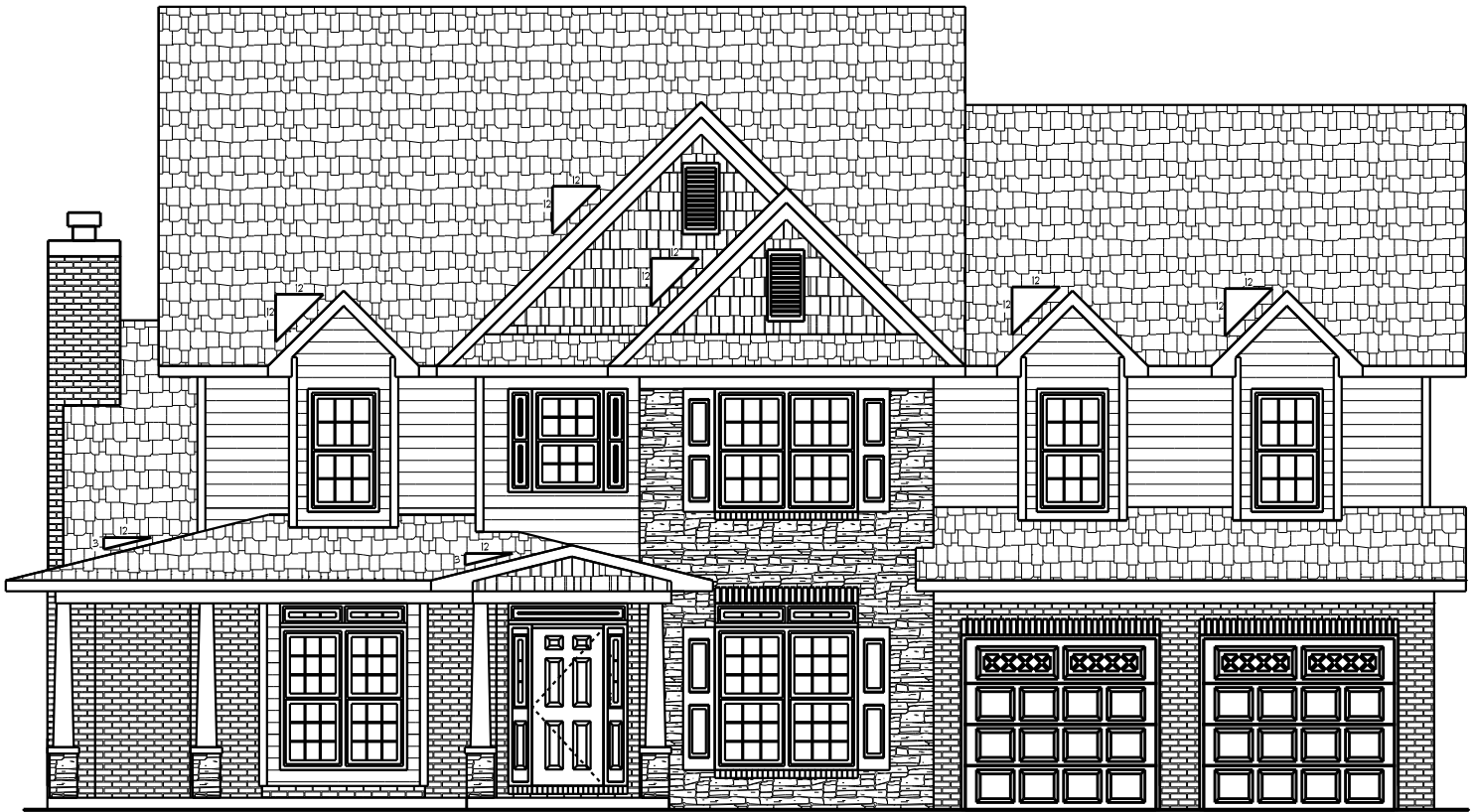
FRONT ELEVATION SC: 1/4" = 1'0"