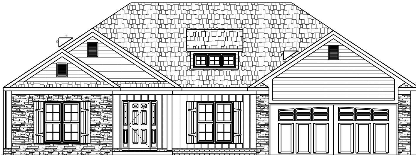
FRONT ELEVATION SC: 1/4" = 1'0"