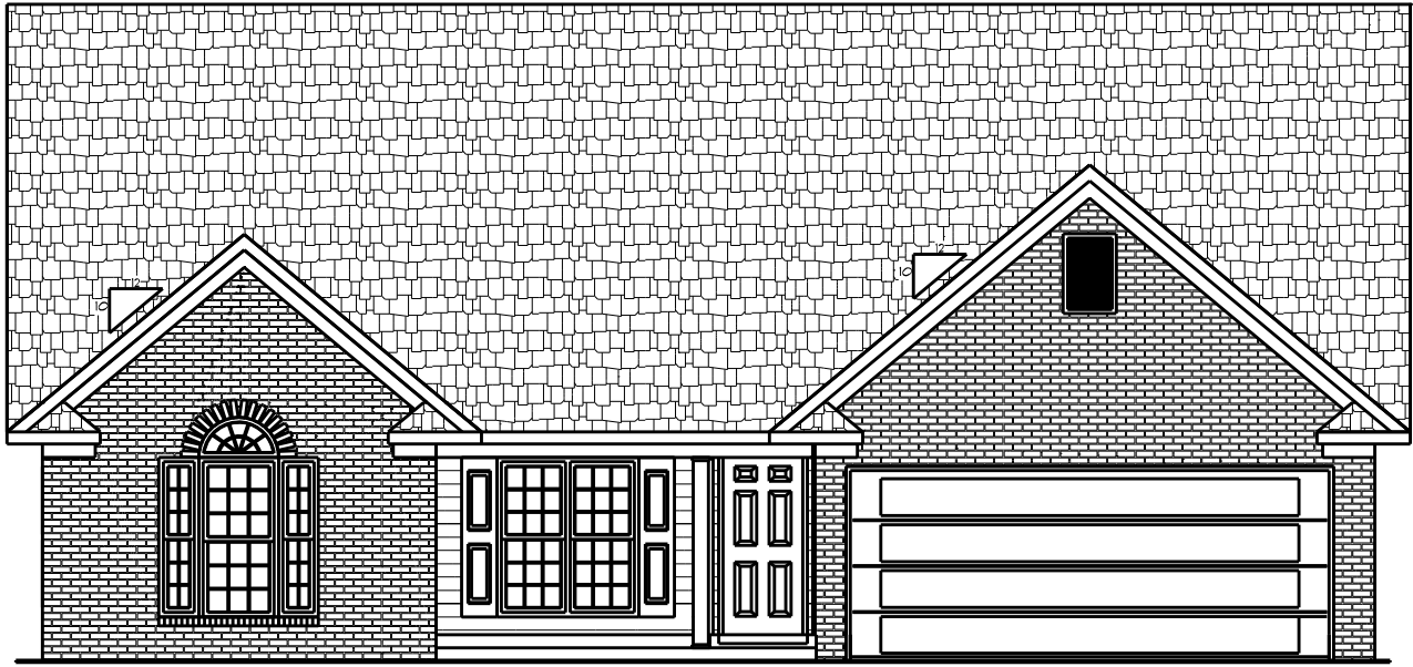
FRONT ELEVATION SC: 1/4" = 1'0"