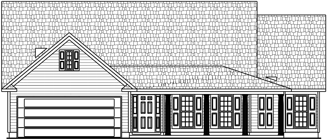
FRONT ELEVATION SC: 1/4" = 1'0"